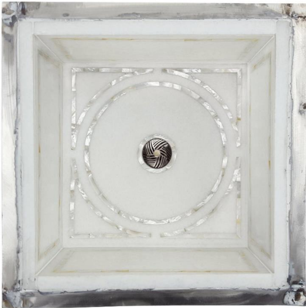
Shown with D013 PS-SCR02-N drain