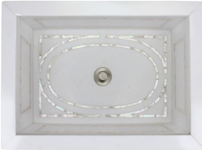
Shown with D005 SN